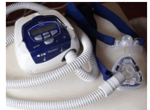
Apnea cpap machine

Due to the lack of energy and rest, I had to cancel the last part of the studies with the Zimbabweans and Arao coming here for study. I have tentatively rescheduled it for January of next year, if the Lord wills.