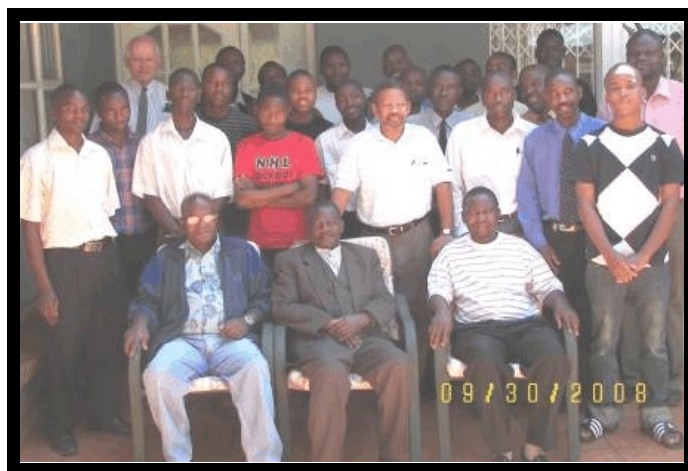
Special Study Classes – Monday