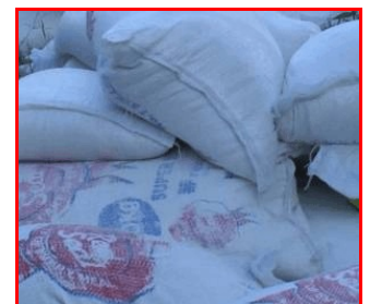
Bags of mealie meal

Zimbabwe & Mozambique Relief on the way - Brethren have once again responded in a noble way toward the needs of the Zimbabwean saints. We are working on a suitable way to get relief to the brethren. As of now, Western Union will not allow my brother to take money and send it to Zimbabwe because of the large amount already sent out in January by him. This may present a problem, but we are working on another avenue at the moment. I cannot leave for Zimbabwe until next mid-week due to helping the brother mentioned above with his eye