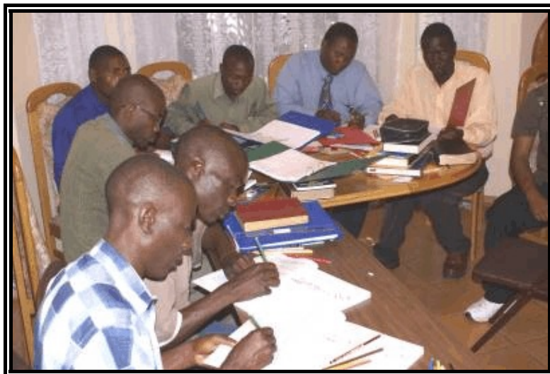
Most of the men in the Bible Class