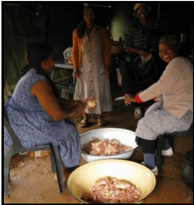
Loding women cutting up chicken