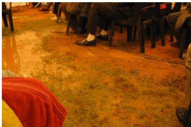
Notice the electrical cord in the water

Loding Lectures- The lectures at Loding over the Easter weekend were adventurous and informative. You can see by the picture the continual rain that was received and the fording of the road which a swollen river took over. The church at Loding provided two tents joined together in one of the brethren's back yard.