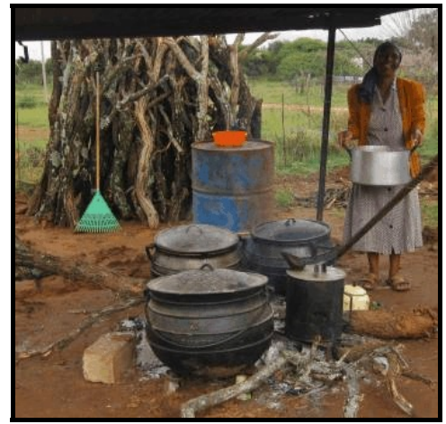
Food provided by individuals at Loding

Ha Matsa Lectures- While brethren from all over South Africa came to Loding to study together over the holiday weekend, the Venda brethren made their own lectureship in Venda. The church at Ha Matsa sent out invitations to brethren in Venda requesting each church to send R50 each to help feed the people at the lectures. This was unlike any of the lectures among the brethren for a long time. Where there was no authority from the scripture for the church to pay expenses like feeding brethren who are not needy, the Loding brethren paid for thier hospitality out of their own pockets and donations from individuals. The Ha Matsa church solicited from the church treasury. They also invited a