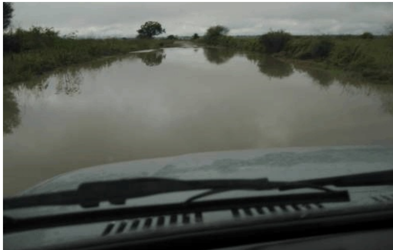
Deciding to cross where the river has over run its banks.