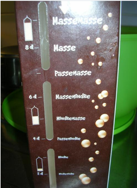
Norwegians watch their chocolate milk levels very closely.