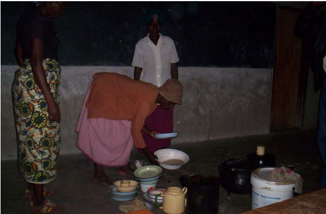
Thank you for cooking for us