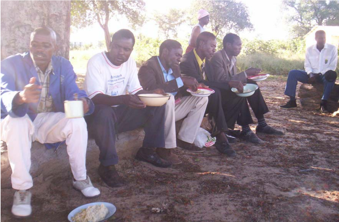
Taking a lunch break