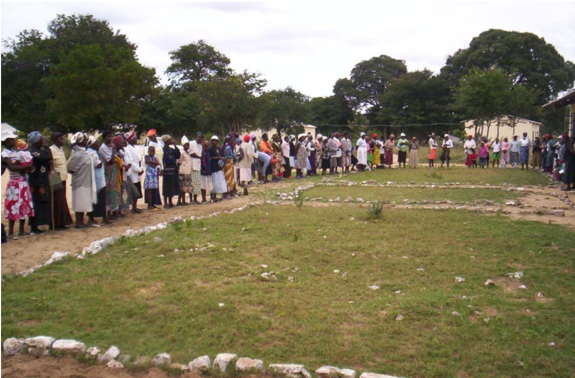
Christians at Sunday service