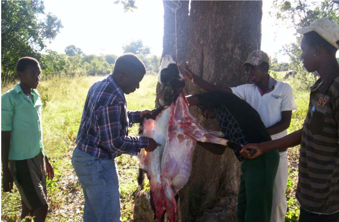
Just be careful with the knife