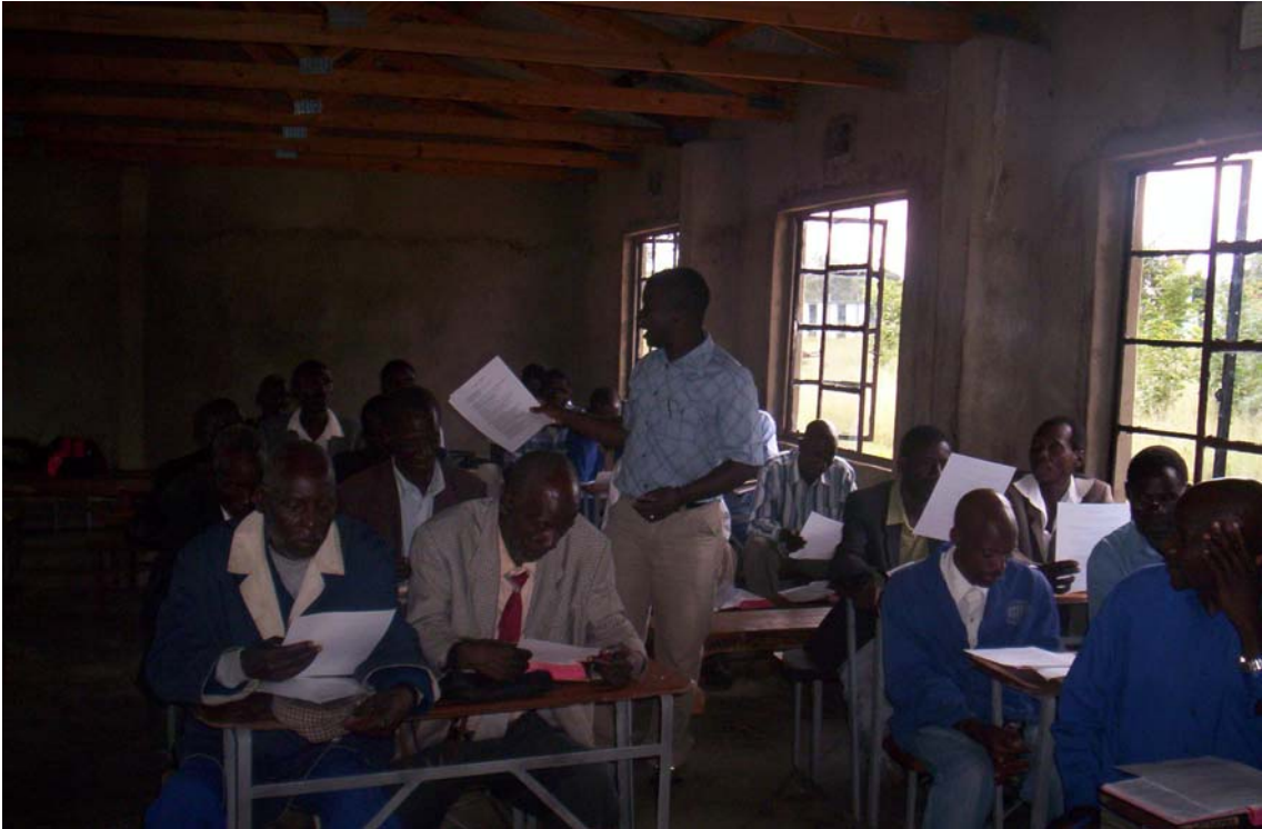
Solomon & Preachers