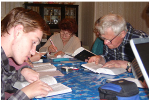
Brethren intently study Bible