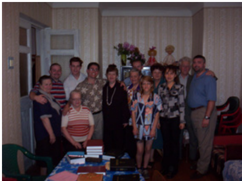
Mariupol church after worship