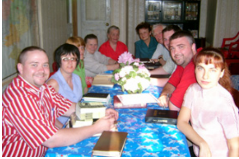
After worship - Sun June 6