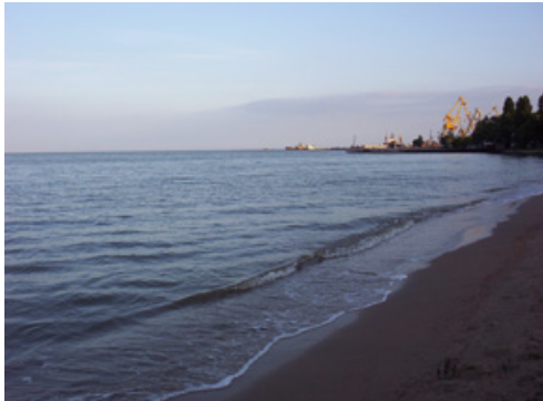
Sea of Azov (Black Sea)