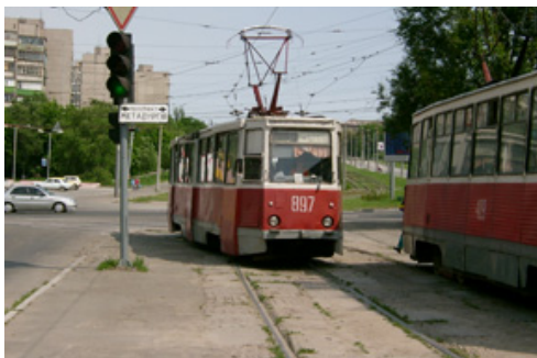
1930-40 elect. power trans.