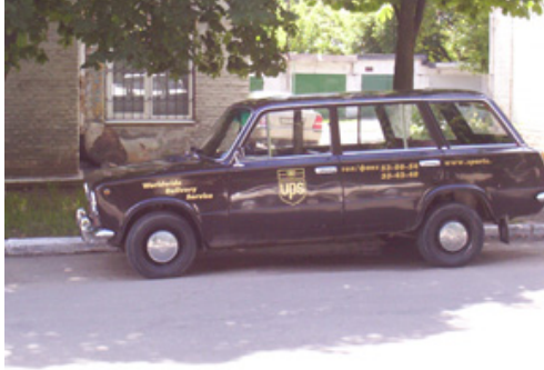
Mariupol gets UPS!