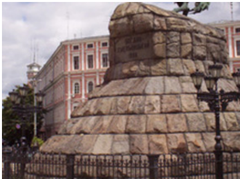
Statue in Kiev