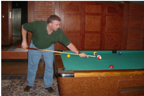
Down time at Kiev hotel