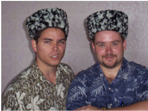
Kipp/Mitch styling Russian hat