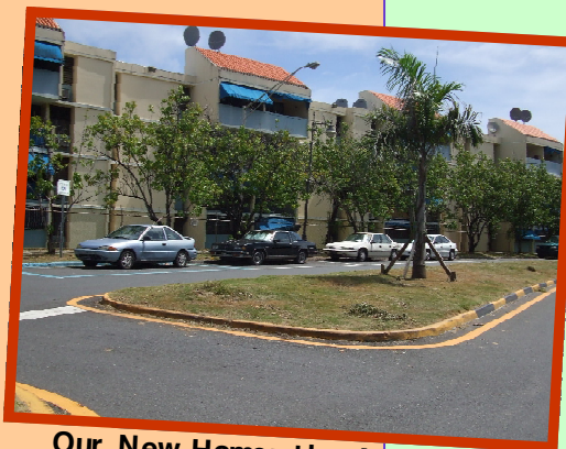
Our New Home: the Apartment

My upcoming plans include individual studies with various members, passing out information about the church to the community and trying to make contacts for personal Bible studies. Be praying for us as we make these efforts to find open hearts to teach. Pray specifically for our landlords—they are wonderful people that we have already become good friends with. We hope to have opportunities with them down the road.