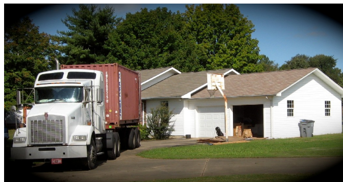
The Moving Crate Arrives at the House in Alabama

Four years ago, God blessed us greatly in giving us the brethren at the West Rogersville church to work with. They have been a blessing in so many ways, showing us kindness and care, and being pa-