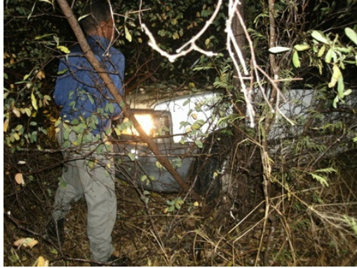
Straight into the bush