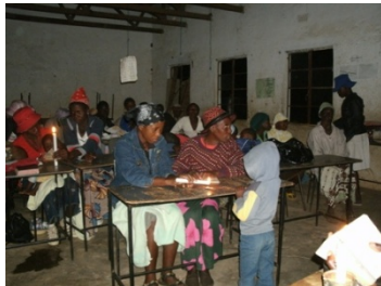
Christians at night studies.

It rained heavily around 5pm on this day just after the meeting we left Tshakhabanda around 6pm. we drove on the wet and slippery roads unfortunately we vied off the road into the bush we crashed into a tree thank God no one was injured myself, Brewer and Israel .