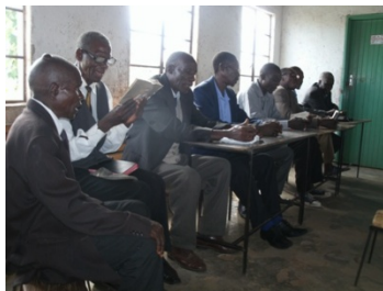
Dedicated man of Tsholotsho

On the Lord's day I was asked to preach. I taught about Christ and why he died on the cross.