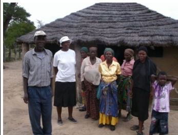
Meeting in Sasedza