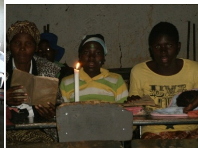
Candle light Is great....