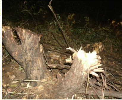
The stub that saved lives

It rained heavily around 5pm on this day just after the meeting we left Tshakhabanda around 6pm. we drove on the wet and slippery roads unfortunately we vied off the road into the bush we crashed into a tree thank God no one was injured myself, Brewer and Israel .